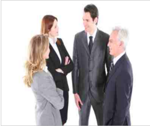
Figure 4. Businessman and businesswoman standing chatting (k6713068 Fotosearch Stock Images Photograph Royalty Free, 2017). Source: Fotosearch Stock Images Photograph Royalty Free. (2017). Businessman and businesswoman standing chatting. Retrieved from http://www.fotosearch.com/CSP671/k6713068/