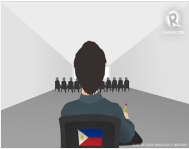
Figure 1. A man sitting at the back row (Geronimo, 2013).