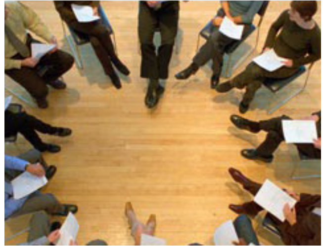
Figure 6. Small group (Synchronoose, 2014).