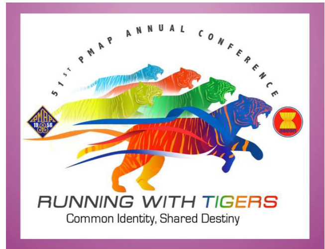
Figure 3. Running with Tigers at the 51 st PMAP Annual Conference (Thenewsguy, 2014).

Source: Geronimo, J. (2013). Aman sitting at the back row. Retrieved from https://www.rappler.com/move-ph/issues/education/44146-asean-2015-philippine-higher-education or Geronimo, J. (2013). The road to ASEAN 2015: Why are PH colleges lagging behind? Retrieved from https://www.rappler.com/move-ph/issues/education/44146-asean-2015-philippine-higher-education