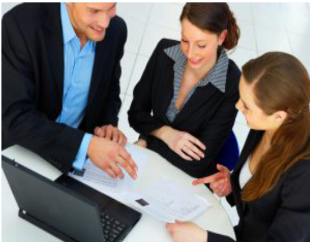
Figure 5. Operations (Nybbles and Bytes, 2017).