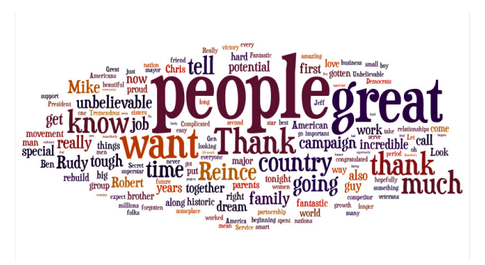
Figure 2. Word cloud of Trump's victory speech.

Both Trump's victory and inaugural speeches were uploaded to the website of the programme so that the word clouds could be generated. The results are shown in Figure 2 and Figure 3 respectively.