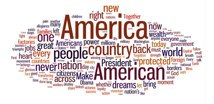
Figure 4. Word cloud of Trump's inaugural speech.