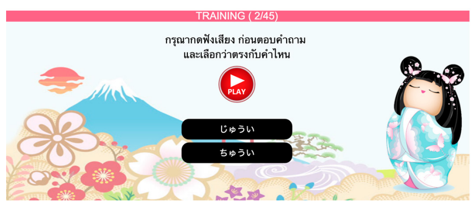
Figure 2. Screenshot of Nihongo Speech Trainer: Two forced-choice identification task.