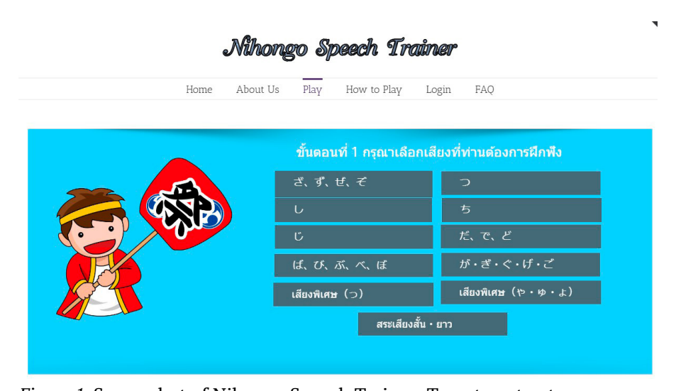
Figure 1. Screenshot of Nihongo Speech Trainer: Target contrasts